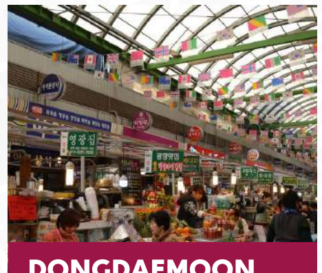
DONGDAEMOON NIGHT MARKET